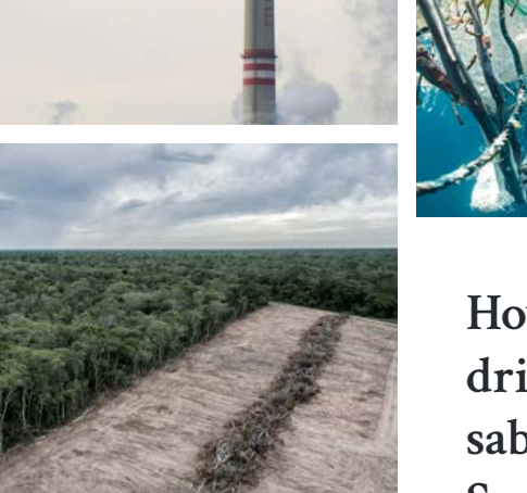
How oil, gas and coal are driving climate change and sabotaging the United Nations' Sustainable Development Goals